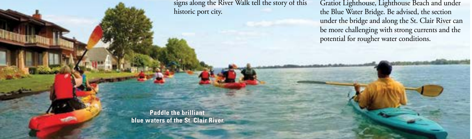
Paddle the brilliant blue waters of the St. Clair River.

This fun paddle route passes by the Fort Gratiot Lighthouse, Lighthouse Beach and under the Blue Water Bridge. Be advised, the section under the bridge and along the St. Clair River can be more challenging with strong currents and the potential for rougher water conditions.